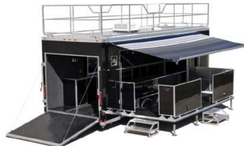
Stage / Custom / Corporate